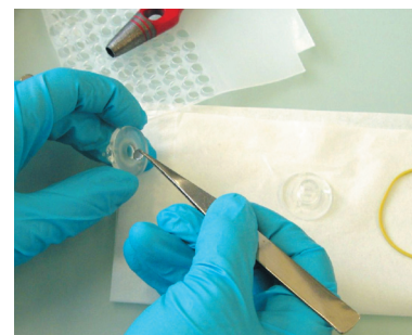
Figure 2 Preparation of the PDMS-PAMPA system. The acceptor and donor PDMS were cut out from the PDMS sheet in the background (and cleaned prior to use) and inserted into a glass cell. The magnetic tumble stir bar is added before assembling the two half-cells with the thin PDMS gill model membrane in between.

preloaded with the test compound is in contact with a water compartment and is cut off from an identical but clean acceptor PDMS disk by a thin PDMS membrane which acts as gill membrane model. (Figure 1). The thickness of the unstirred water layer (UWL) adjacent to all surfaces is adjusted by vigorous tumble stirring to physiological conditions in fish gills. This is a crucial step because for very hydrophobic compounds the rate limiting step of the overall uptake process is actually the slow diffusion through this layer and not the faster diffusion through the gill (model) membrane. Figure 2 shows how the glass cells are assembled and the tumble magnetic stir element is inserted.